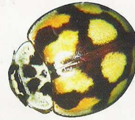
10 spot chequered